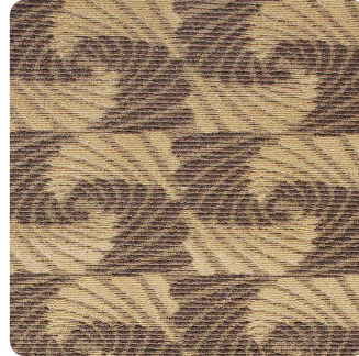
605 - 3 MAJESTIC TAN