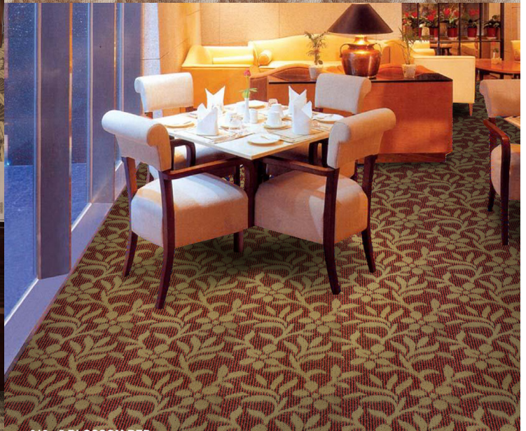
612 - 5 BLOSSOM RED