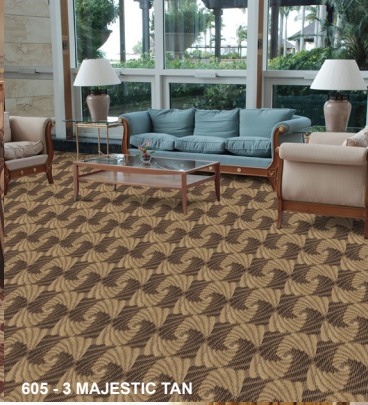
605 - 3 MAJESTIC TAN