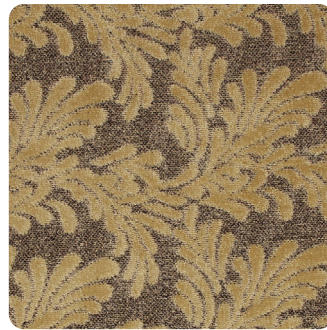
603 - 2 STAMFORD BEIGE