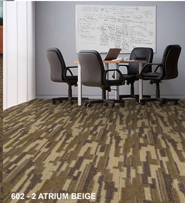
602 - 2 ATRIUM BEIGE