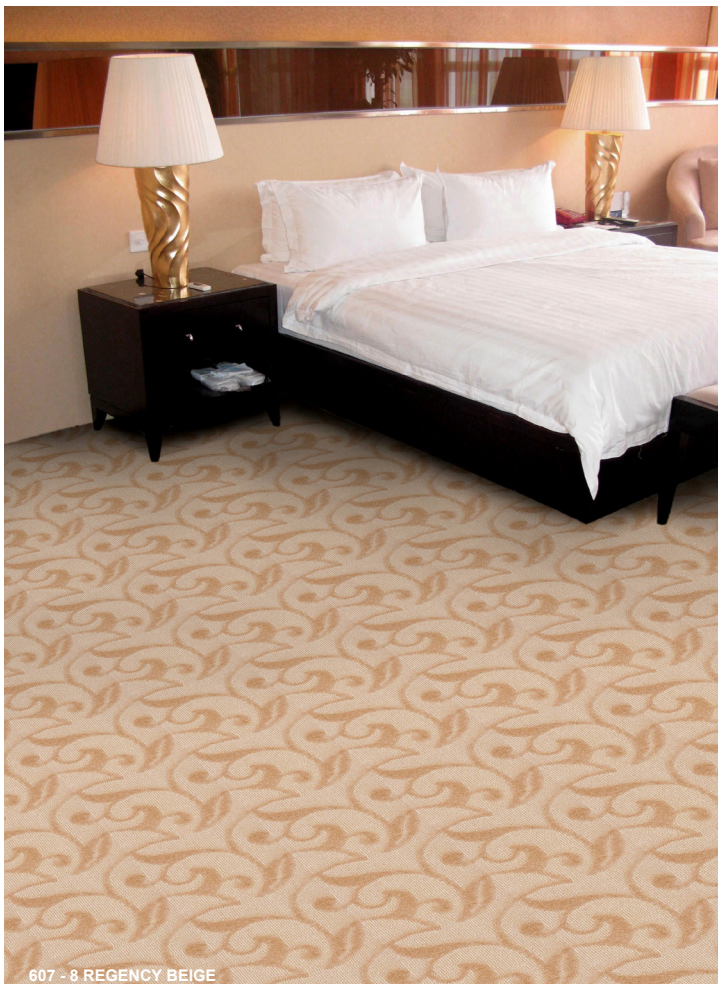
607 - 8 REGENCY BEIGE