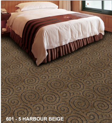
601 - 5 HARBOUR BEIGE