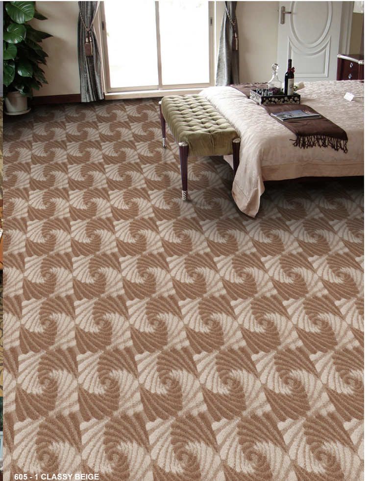
605 - 1 CLASSY BEIGE