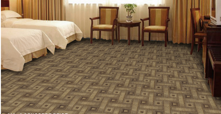
606 - 3 CONCORDE BEIGE