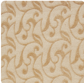
607 - 8 REGENCY BEIGE