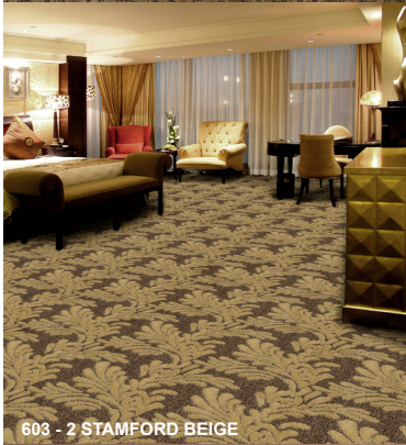
603 - 2 STAMFORD BEIGE