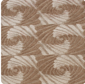
605 - 1 CLASSY BEIGE