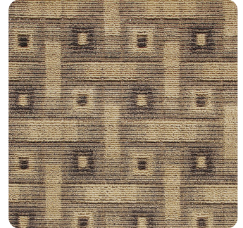
606 - 3 CONCORDE BEIGE