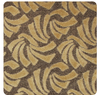
604 - 2 LUXURY BEIGE