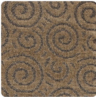
601 - 5 HARBOUR BEIGE