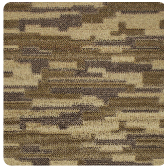
602 - 2 ATRIUM BEIGE