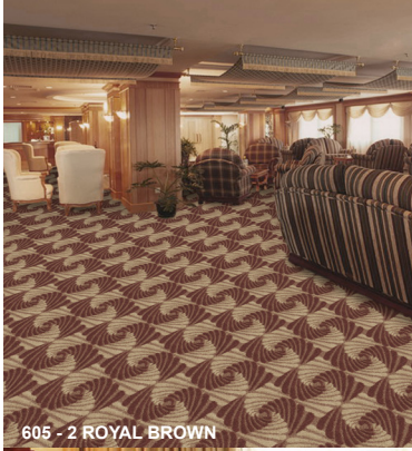
605 - 2 ROYAL BROWN