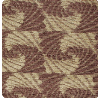
605 - 2 ROYAL BROWN