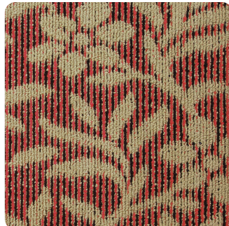
612 - 5 BLOSSOM RED