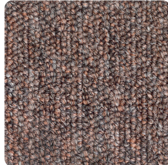
5800 Indian Spice