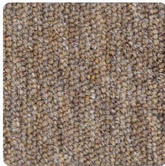
5142 Ginger Brown