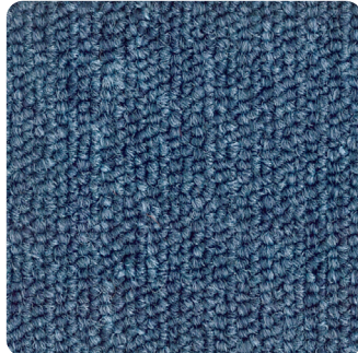
5746 Bristol Blue