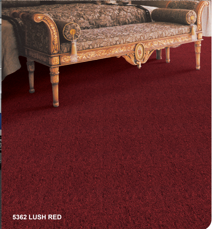
5362 LUSH RED