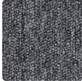
5336 Autumn Grey