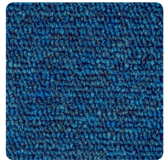
5156 Crystal Blue