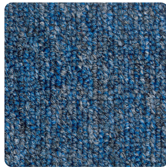
5155 Dalton Blue