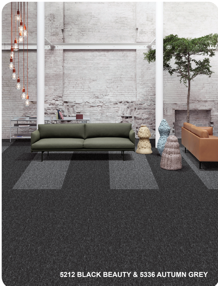
5212 BLACK BEAUTY & 5336 AUTUMN GREY