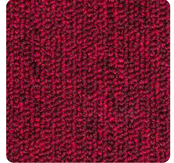
5362 Lush Red