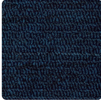
5248 Rich Blue