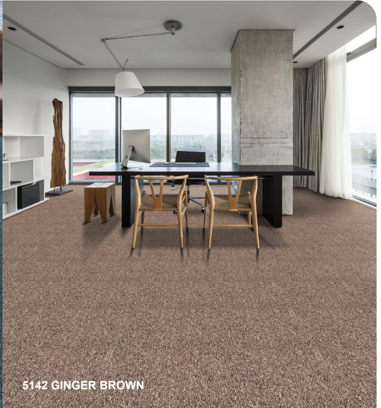
5142 GINGER BROWN