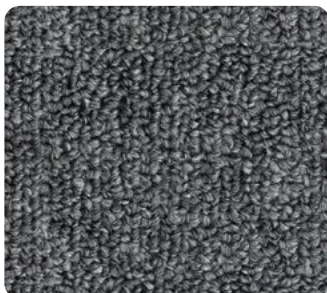
3177 MODERN GREY