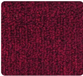
3128 DEEP RED