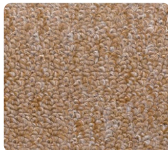
3196 SWEET BEIGE