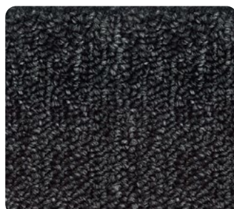
3178 BLACK GRANITE