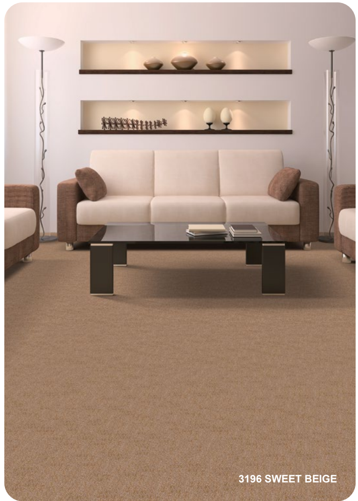
3196 SWEET BEIGE