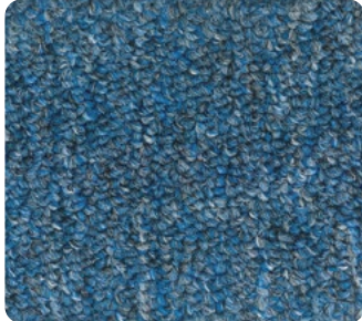
3155 BLUE LAPIS