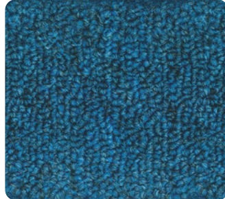
3156 FIERY BLUE