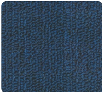
3157 DEEP BLUE