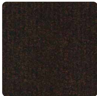
2825 DARK BROWN