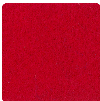
271 ROSSO FIAMMA