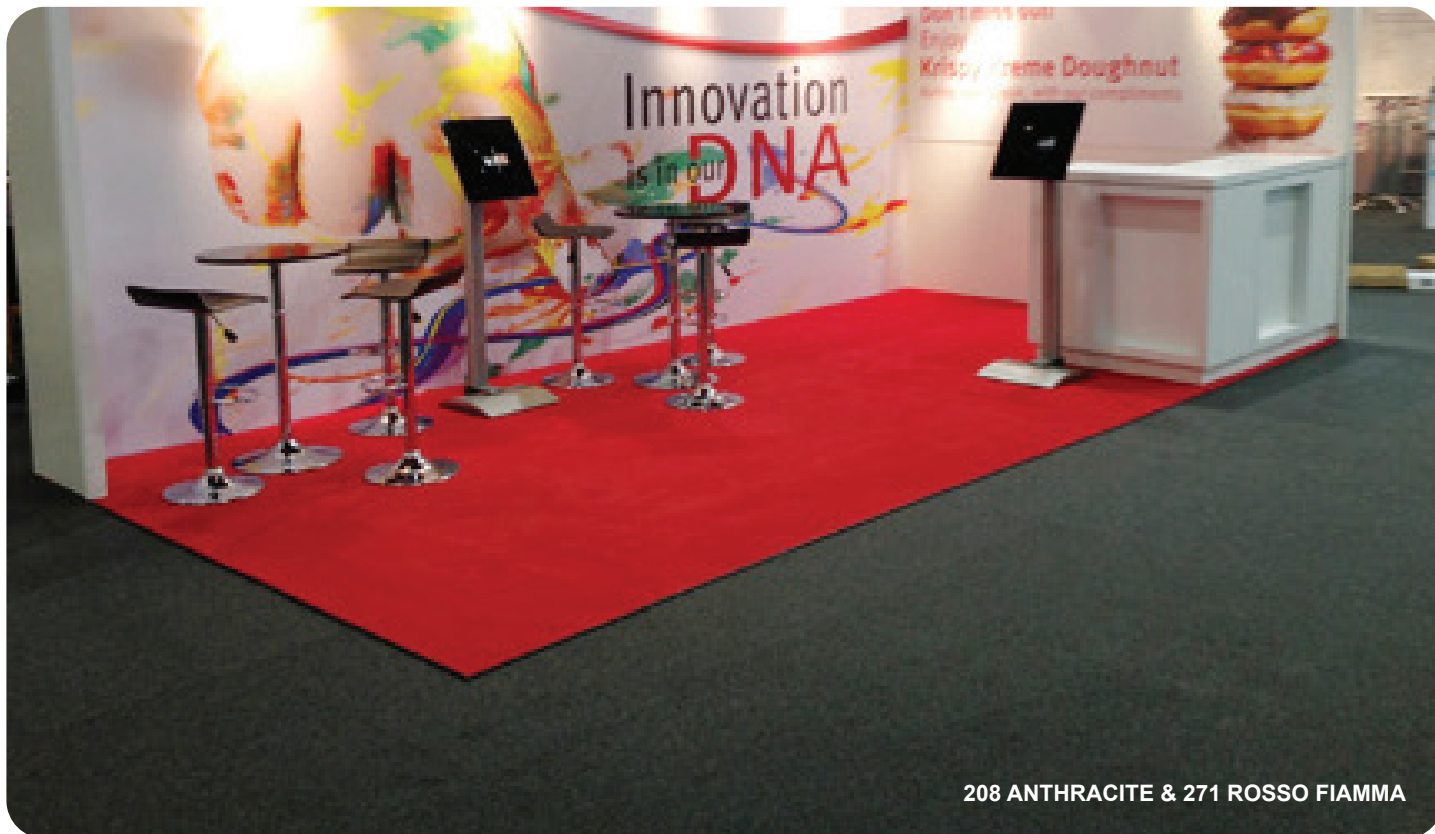
208 ANTHRACITE & 271 ROSSO FIAMMA