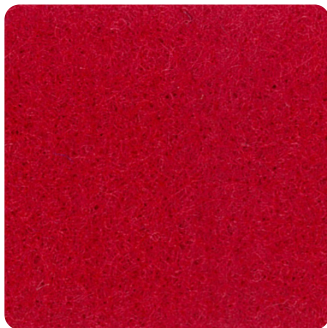
001 BRIGHT RED