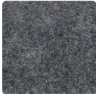
208 DARK GREY