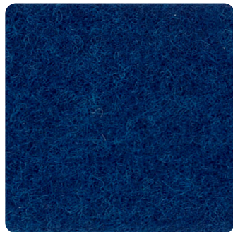
003 NAVY BLUE