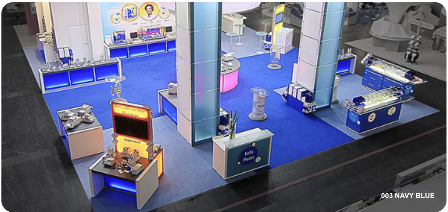
003 NAVY BLUE