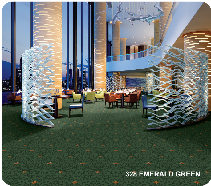
328 EMERALD GREEN