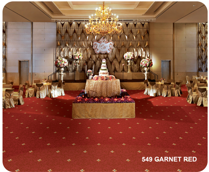
549 GARNET RED