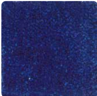
457 Oriental Blue