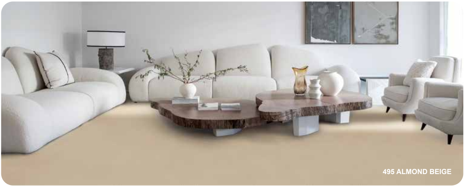
495 ALMOND BEIGE