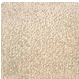
495 Almond Beige