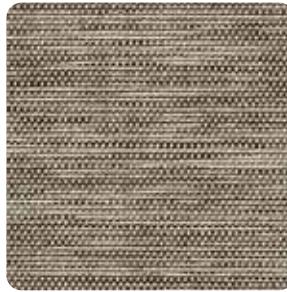
1725 GREY DESIGN Pattern Repeat: 0.62cm(W) x 0.9cm(L)