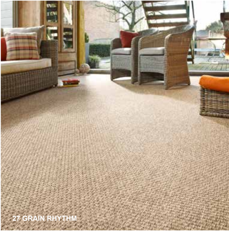
27 GRAIN RHYTHM