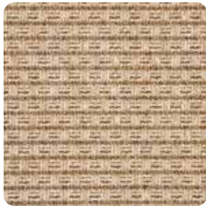
27 GRAIN RHYTHM Pattern Repeat: 1.88cm(W) x 2.72cm(L)