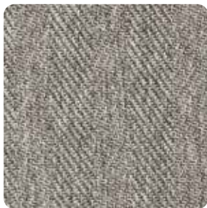
3616 GREY RUSTIQUE Pattern Repeat: 12.5cm(W) x 10.9cm(L)