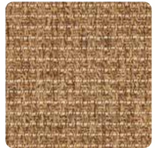
76 CHESTNUT RHYTHM Pattern Repeat: 1.88cm(W) x 2.72cm(L)