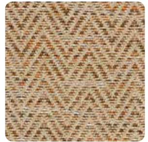
1327 PECAN DESIGN Pattern Repeat: 8.75cm(W) x 2.72cm(L)