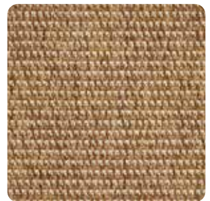
75 CHESTNUT SUNRISE Pattern Repeat: 0.62cm(W) x 2.27cm(L)