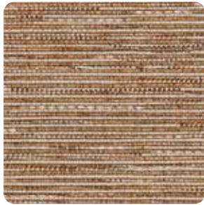
3101 ALMOND DESIGN Pattern Repeat: 100cm(W) x 100cm(L)