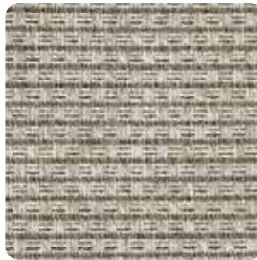
38 GREY RHYTHM Pattern Repeat: 1.88cm(W) x 2.72cm(L)