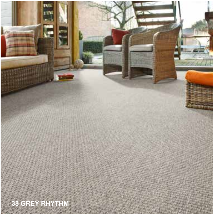
38 GREY RHYTHM