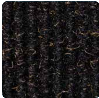
2343 JET BLACK