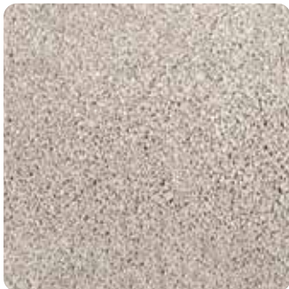
33 Sea Castle