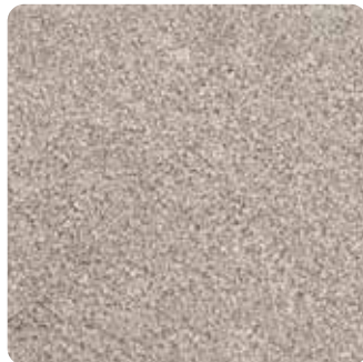
44 Sleek Wood