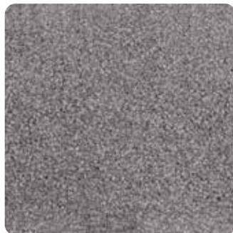
66 Moss Grey