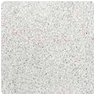
11 Angel White