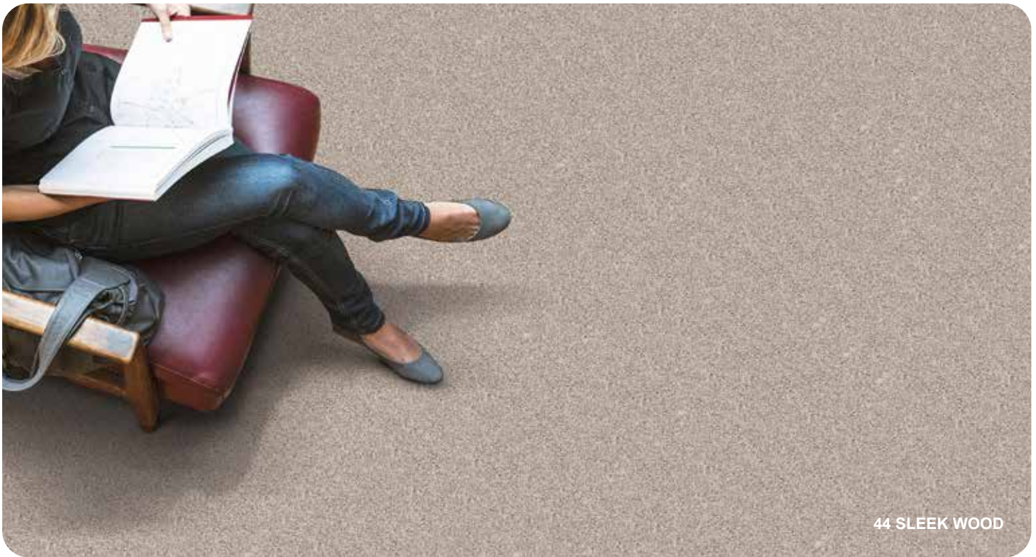
44 SLEEK WOOD